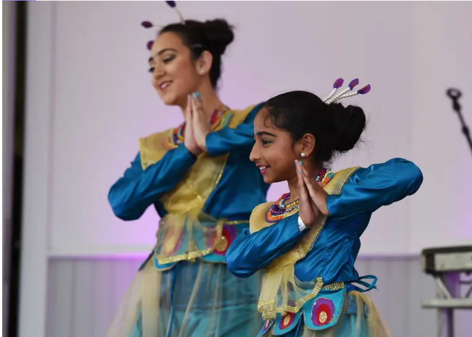
Our commitment to diversity